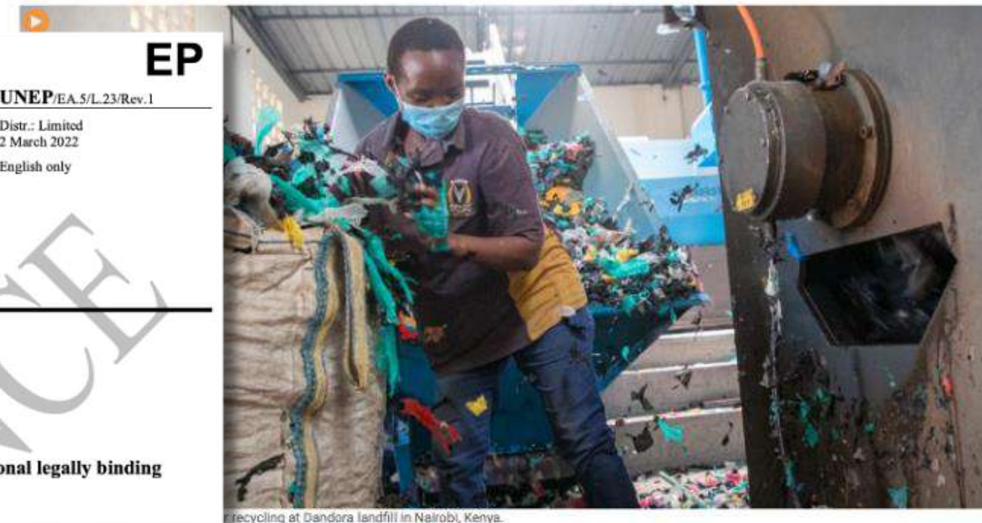
recycling at Dandora landfill in Nairobi, Kenya.